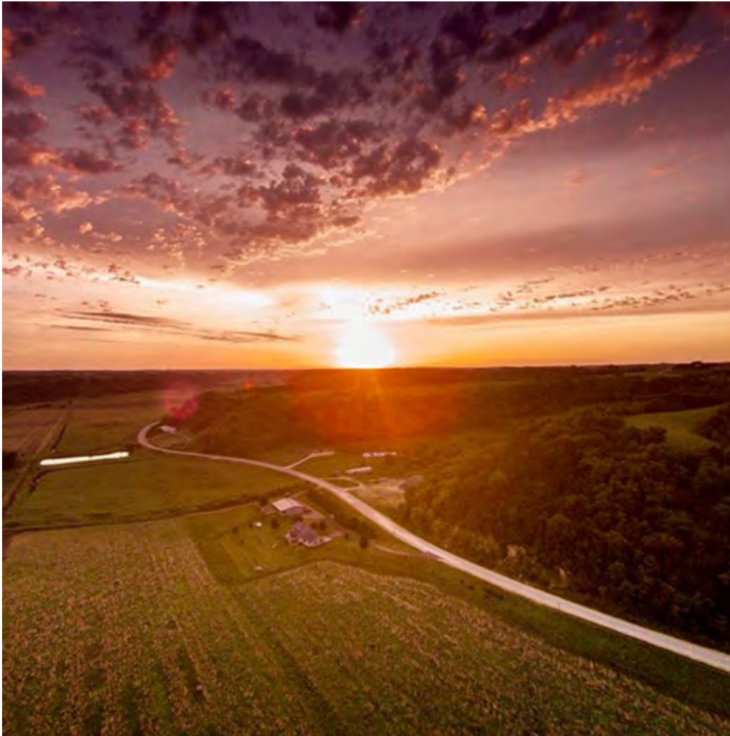
Rural Jackson County landscape