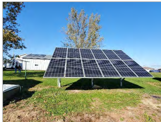
Residential Solar System in Springbrook

5.1 Maintain and modernize critical infrastructure for transportation, broadband, water, sewer, downtowns, and community facilities for a more competitive region.