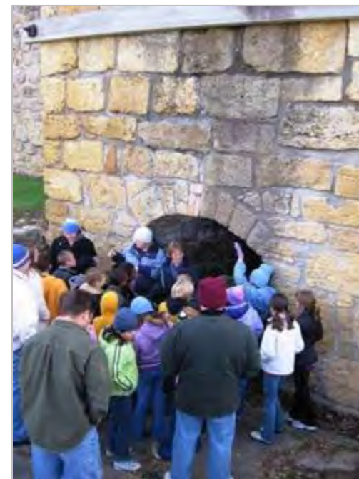
Education at Hurstville Lime Kilns

10.7 Implement the updated Grant Wood Loop Master Plan’s Future Priorities.